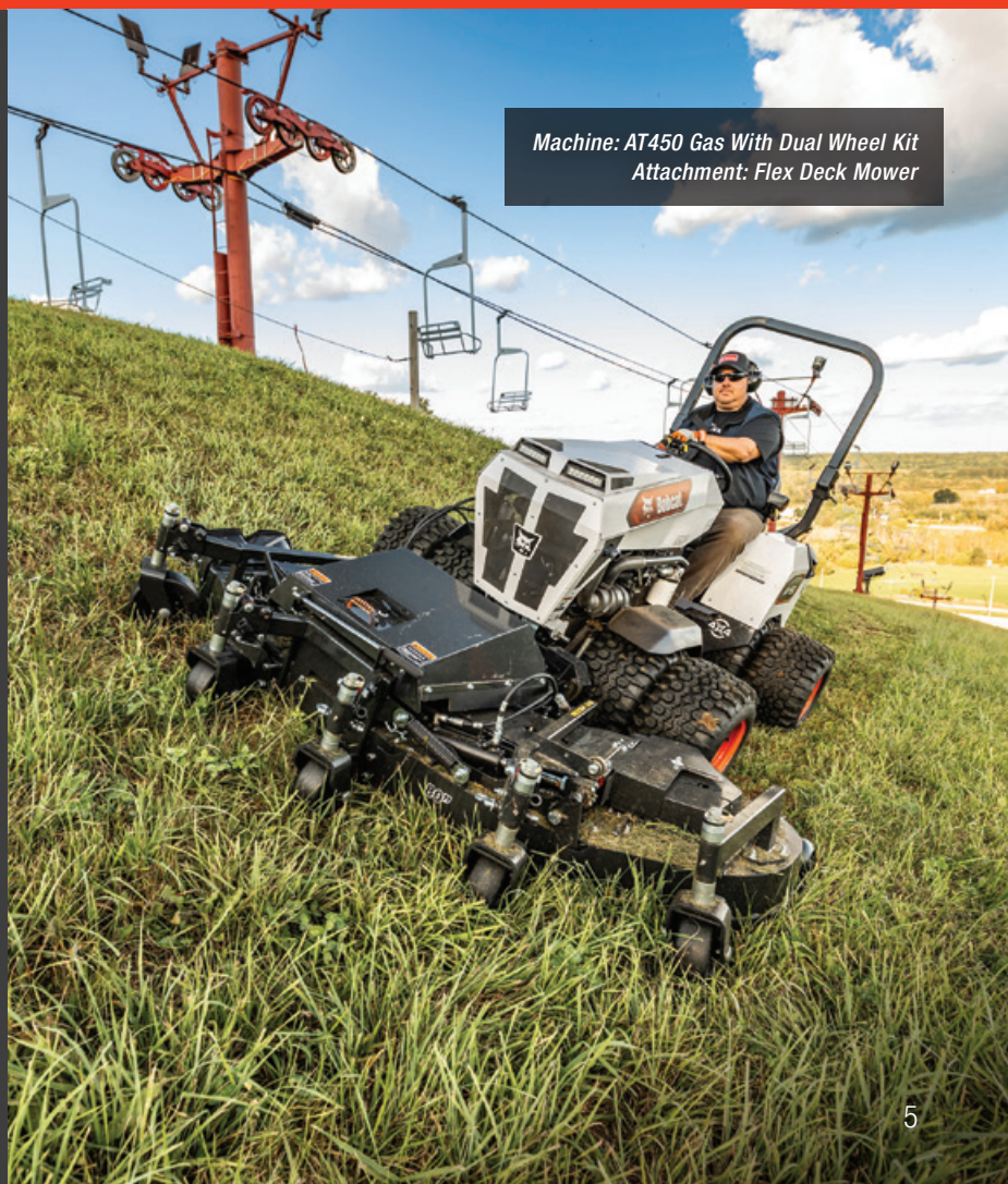
Machine: AT450 Gas With Dual Wheel Kit Attachment: Flex Deck Mower