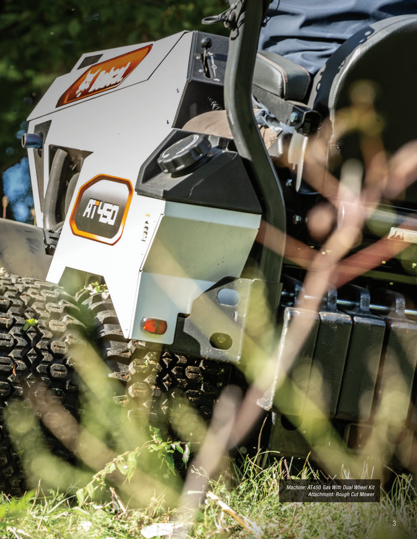
Machine: AT450 Gas With Dual Wheel Kit Attachment: Rough Cut Mower