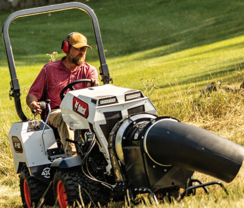
Machine: AT450 Gas Attachment: Turbine Blower

Having the right tool for the right job can make a huge difference in productivity and efficiency. This lineup of attachments is designed to perfectly complement the Bobcat AT450 articulating tractor and turn an already remarkable machine into a versatile powerhouse.