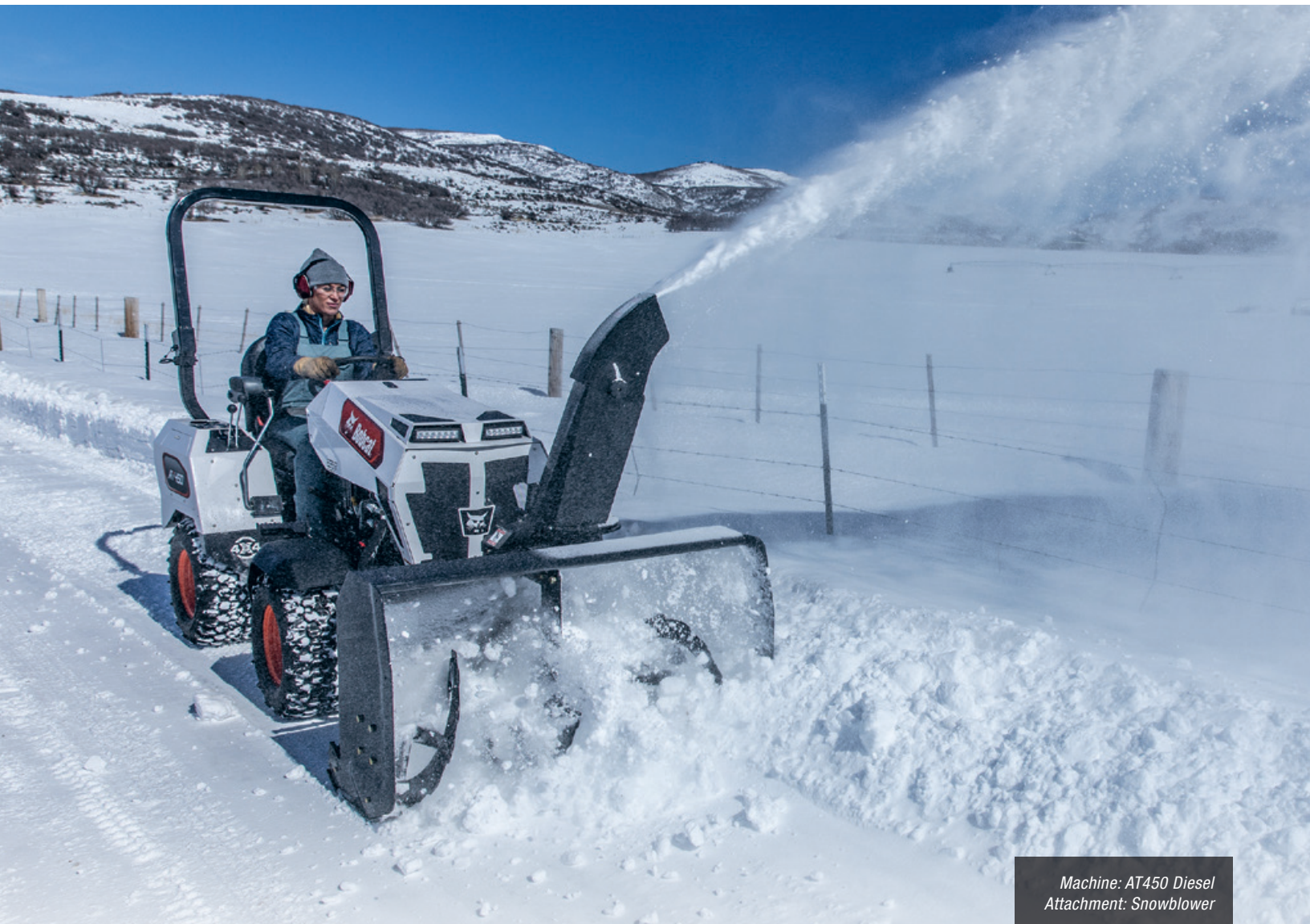
Machine: AT450 Diesel Attachment: Snowblower