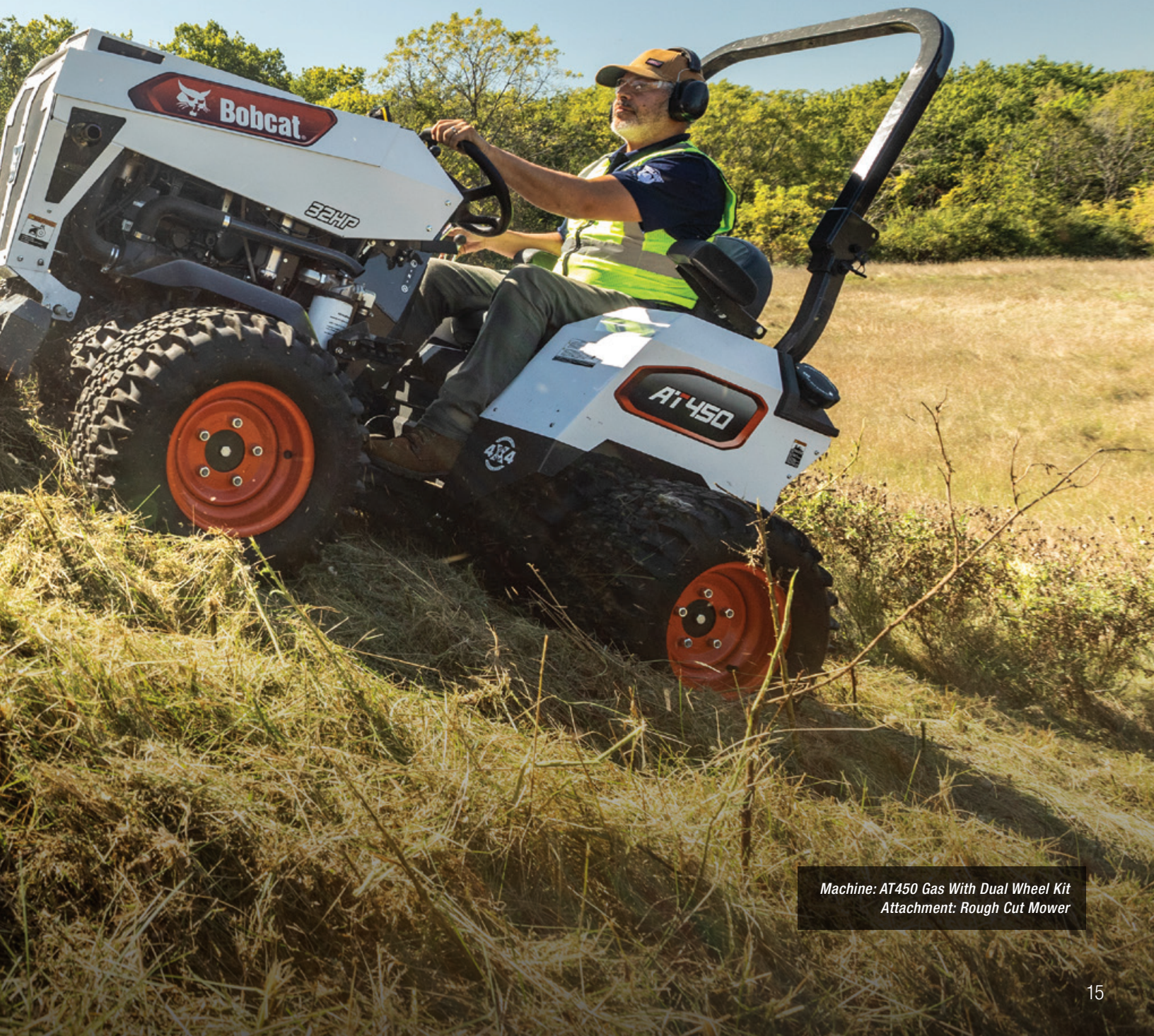
Machine: AT450 Gas With Dual Wheel Kit Attachment: Rough Cut Mower