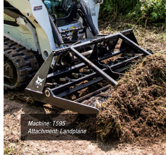
Machine: T595 Attachment: Landplane

Several attachments require control of more than one function. Our small, seven-pin attachment harness activates power and fingertip control functions while eliminating the need for mechanical relays used on other loaders. It's fully integrated with your Bobcat loader for a clean look and protected routing.