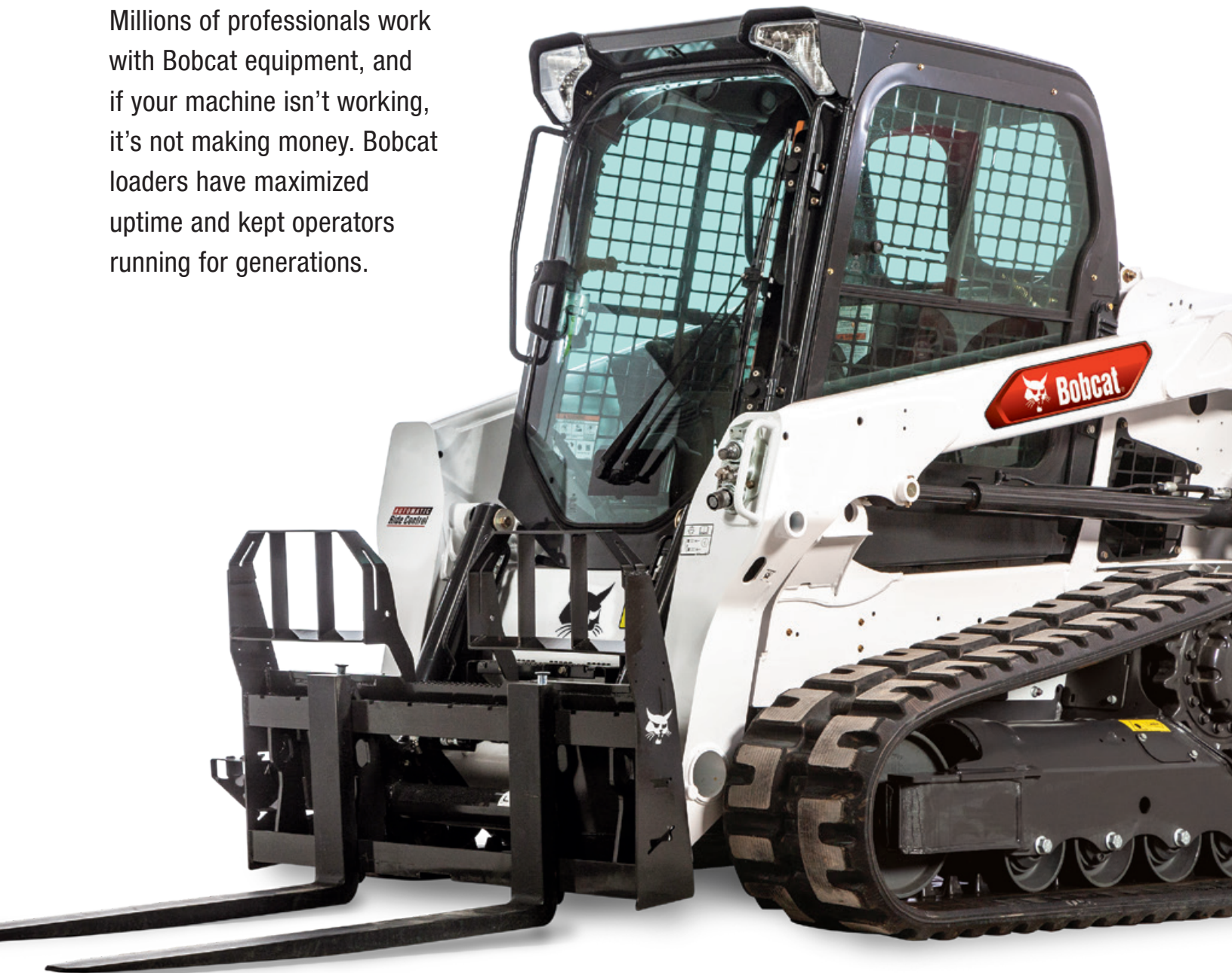
Machine: T550 Attachment: Pallet Fork

Millions of professionals work with Bobcat equipment, and if your machine isn't working, it's not making money. Bobcat loaders have maximized uptime and kept operators running for generations.