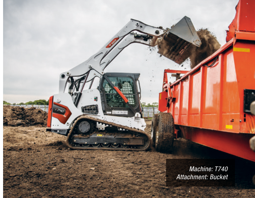
Machine: T740 Attachment: Bucket

The biggest advantage of our Tier 4 solution is simplicity. Bobcat engines meet Tier 4 regulations without a diesel particulate filter (DPF). This reduces downtime that occurs with DPF regeneration and long-term DPF maintenance costs and allows operators to focus on working.