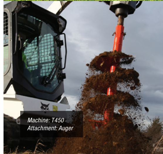
Machine: T450 Attachment: Auger