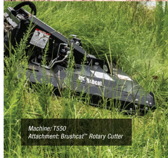
Machine: T550 Attachment: Brushcat™ Rotary Cutter