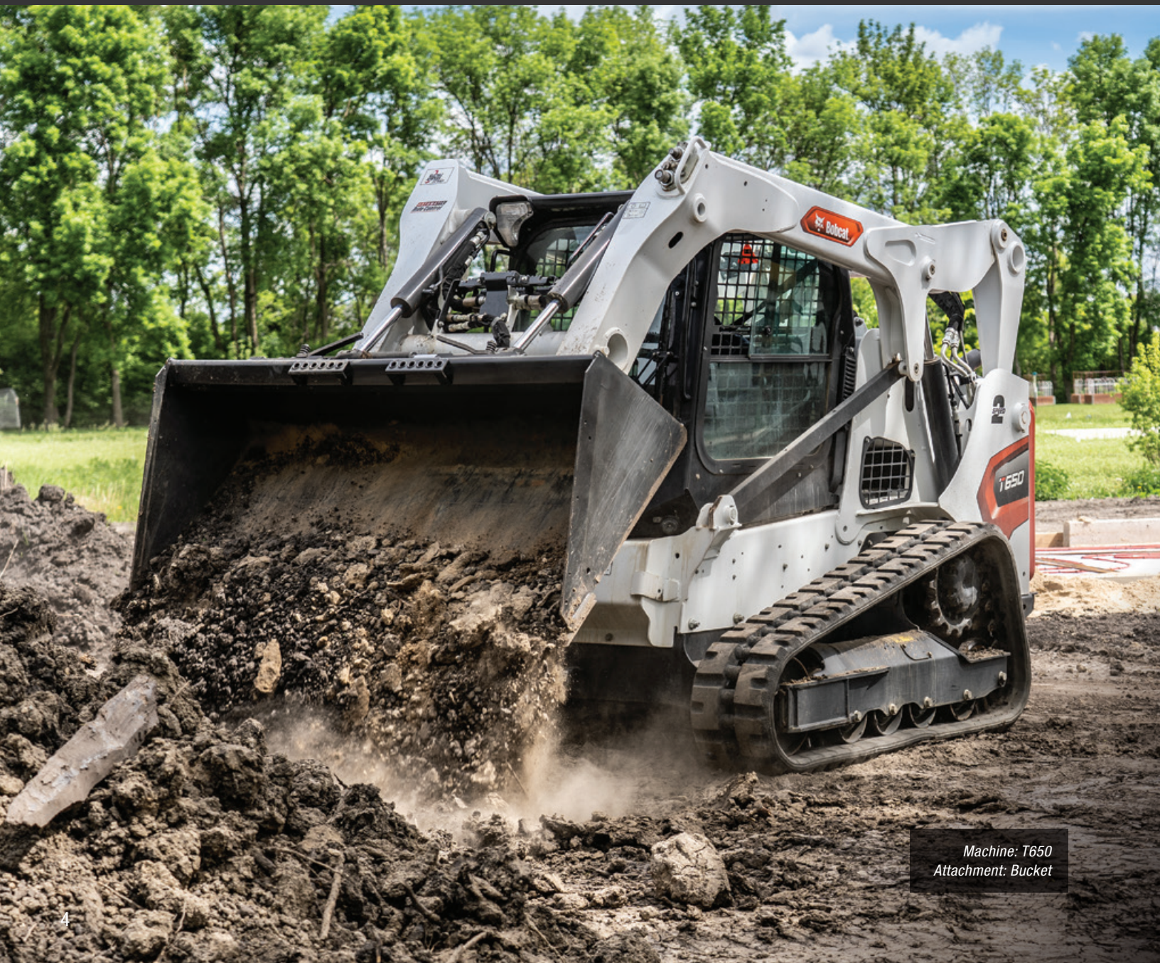
Machine: T650 Attachment: Bucket

Great performance comes from more than just a high-horsepower engine. Bobcat® loaders are designed with a careful balance of engine power, hydraulic pump and cylinder size for faster cycle times. An efficient lift arm design provides powerful breakout forces. If you need to work quicker, lift more and outperform the competition, Bobcat compact loaders are the only choice.