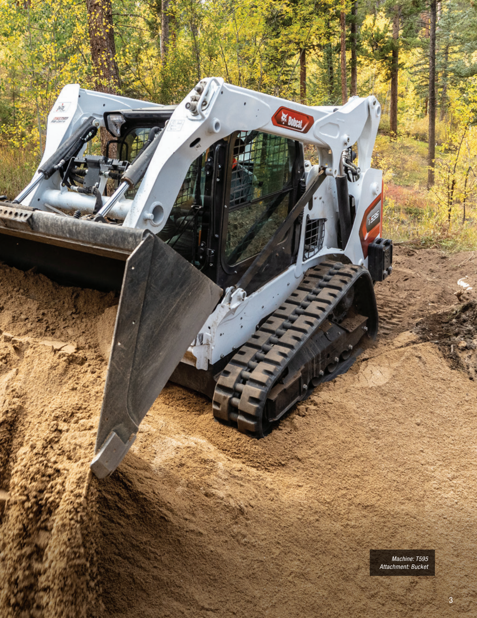
Machine: T595 Attachment: Bucket