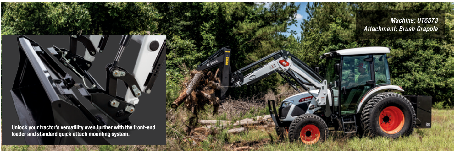
Machine: UT6573 Attachment: Brush Grapple

Unlock your tractor's versatility even further with the front-end loader and standard quick attach mounting system.